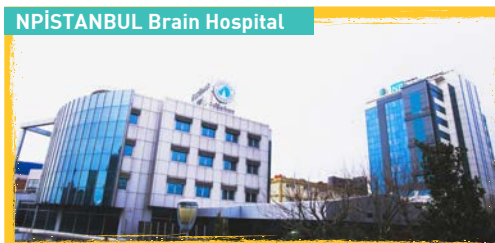
NPİSTANBUL Brain Hospital