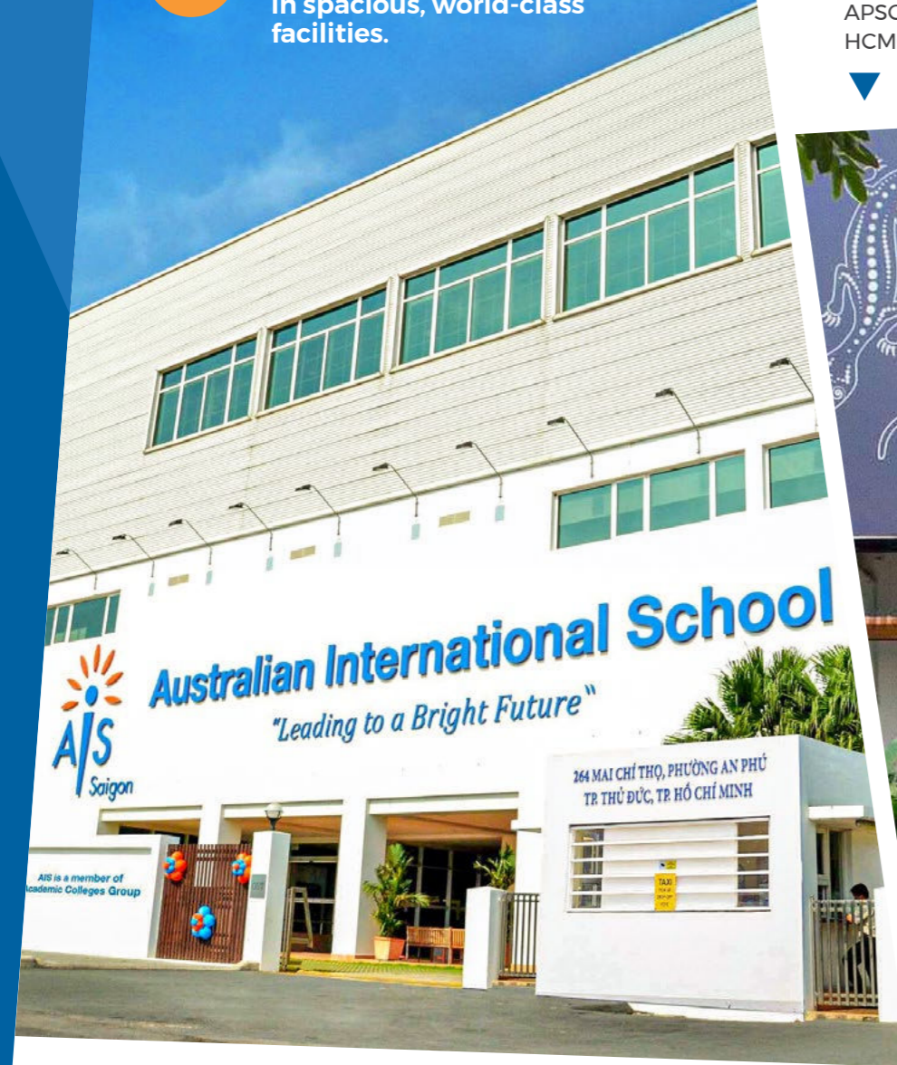
Thu Thiem Campus (Kindergarten - Year 13) 264 Mai Chi Tho), An Phu Ward, Thu Duc City, HCMC, Vietnam

1 High quality international learning in spacious, world-class facilities.