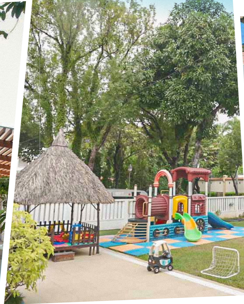
Lotus Campus (Kindergarten - Year 1) APSC Compound, 36 Thao Dien Road, Thao Dien Ward, Thu Duc City, HCMC, Vietnam

3 Caring, relational and personalised learning in a green space