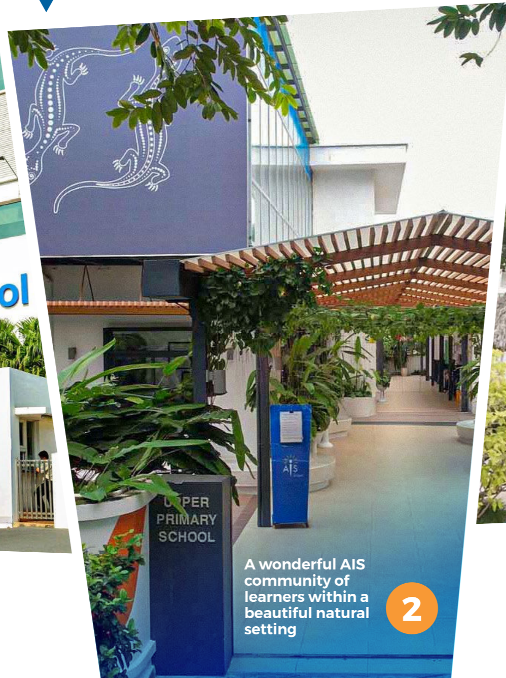
A wonderful AIS community of learners within a beautiful natural setting

Cherry Blossom Campus (Year 2 - Year 6) APSC Compound, 36 Thao Dien Road, Thao Dien Ward, Thu Duc City, HCMC, Vietnam