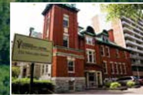
Laurentian Leadership Centre (Ottawa, ON)