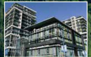
TWU Richmond (Richmond, BC)